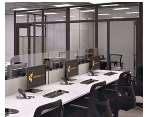
REFERENCE IMAGE - NOT SPECIFIC TO THIS PROJECT